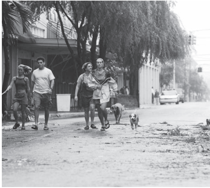
FILE PHOTO Locals take a walk on Duval after Hurricane Georges in 1998. Keys official have a thorough hurricane plan in place.

"On January 24, 2003, the low was 45 degrees. It set a record as the lowest temperature ever recorded on that date," said a senior